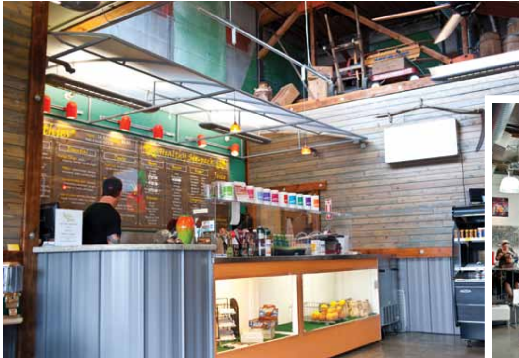
Both shops are ran out of the same building by a husband and wife team. They live in the building, too.